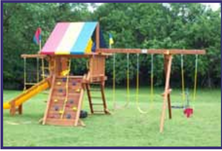
Pictured: Playground at Women's FIRSTSTEP

The Mission Committee of Southern Hills Baptist Church, 8601 S. Pennsylvania, Oklahoma City, OK, raised donations for a new playground for Women's Firststep Residential Recovery center this past year. The mission committee members raised approximately $4,000 and purchased playground equipment including an activity area and swing set for the children whose mothers are in recovery. Southern Hills Baptist Church has been a wonderful supporter of the Firststep recovery programs over the past year, providing men and women's clothing, AA Recovery Bibles, and Under Armor from Bass Pro for the ladies at Firststep who work in the cold. Thank you Southern Hills Baptist Church and Mission Committee!